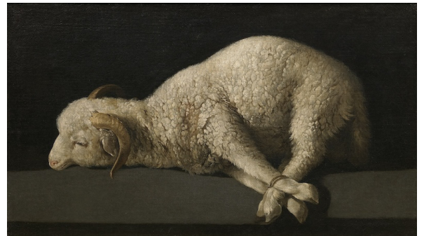
The sacrificial lamb of God

of the guilty. But redemption comes through the innocent, when they open themselves to God and, rather than returning evil to the guilty, offer their sufferings for them. The Church in America, hemorrhaging members and bereft of vocations for years now, needs this moment of redemption. It's not time for the faithful to walk away. It's time to come forward and lead the charge for spiritual renewal.